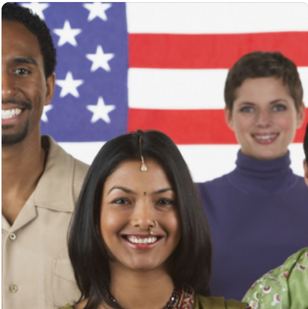
Home - Highland Park - Highwood Legal Aid Clinic