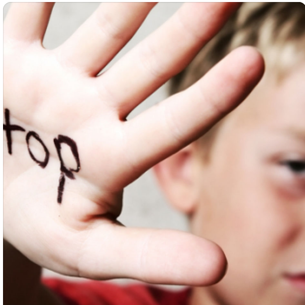
Home - Highland Park - Highwood Legal Aid Clinic